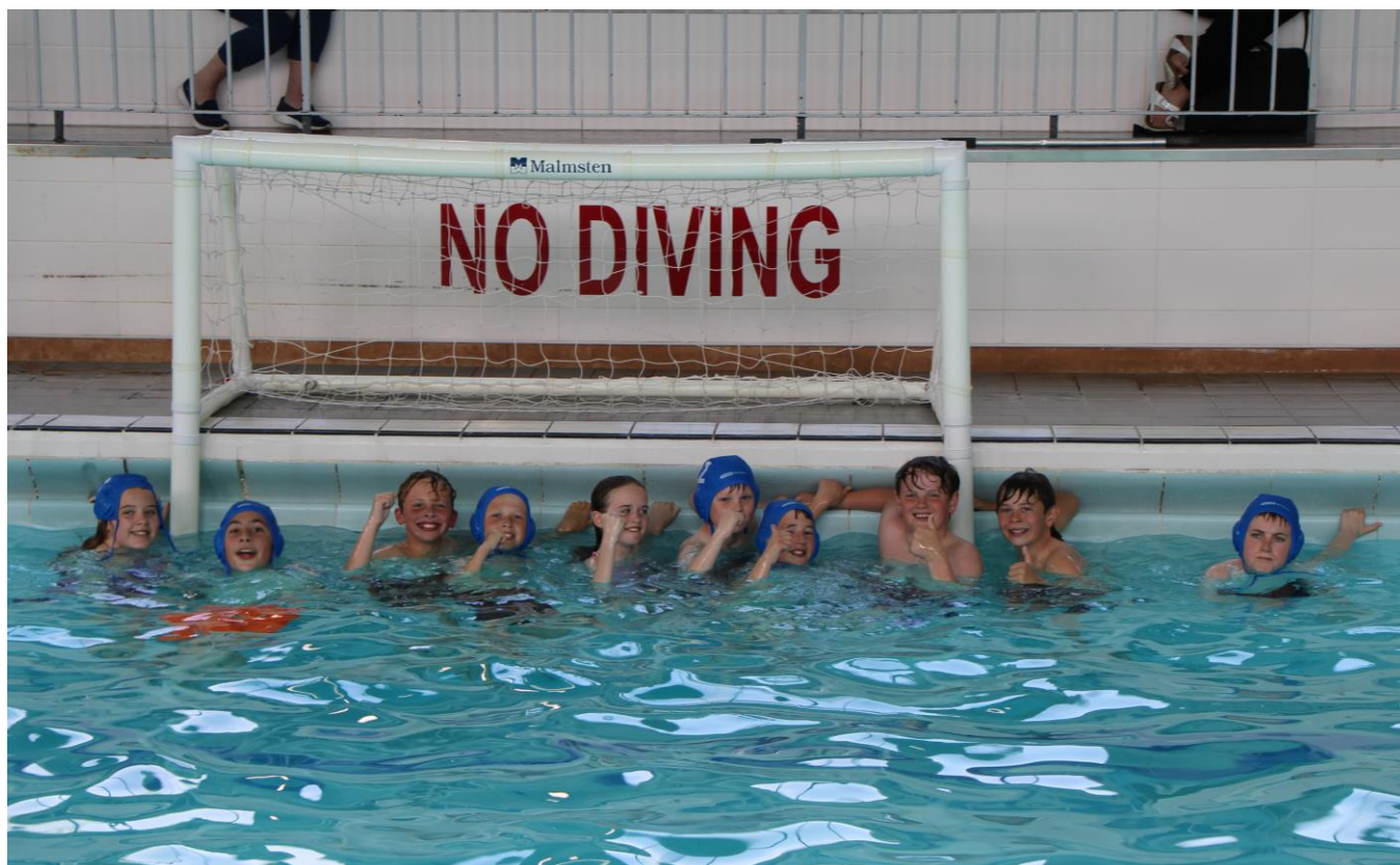
Wednesday 30 th April 2025: Winners of the ATSA KS2 Mini Water Polo Competition: St. Benedict's