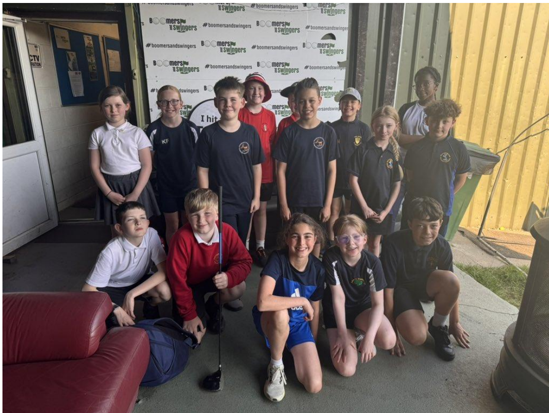
Thursday 1 st May 2025: ATSA Golf Taster Session