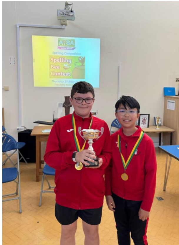
Thursday 1 st May 2025: Winners of the ATSA Spelling Competition: Holy Family