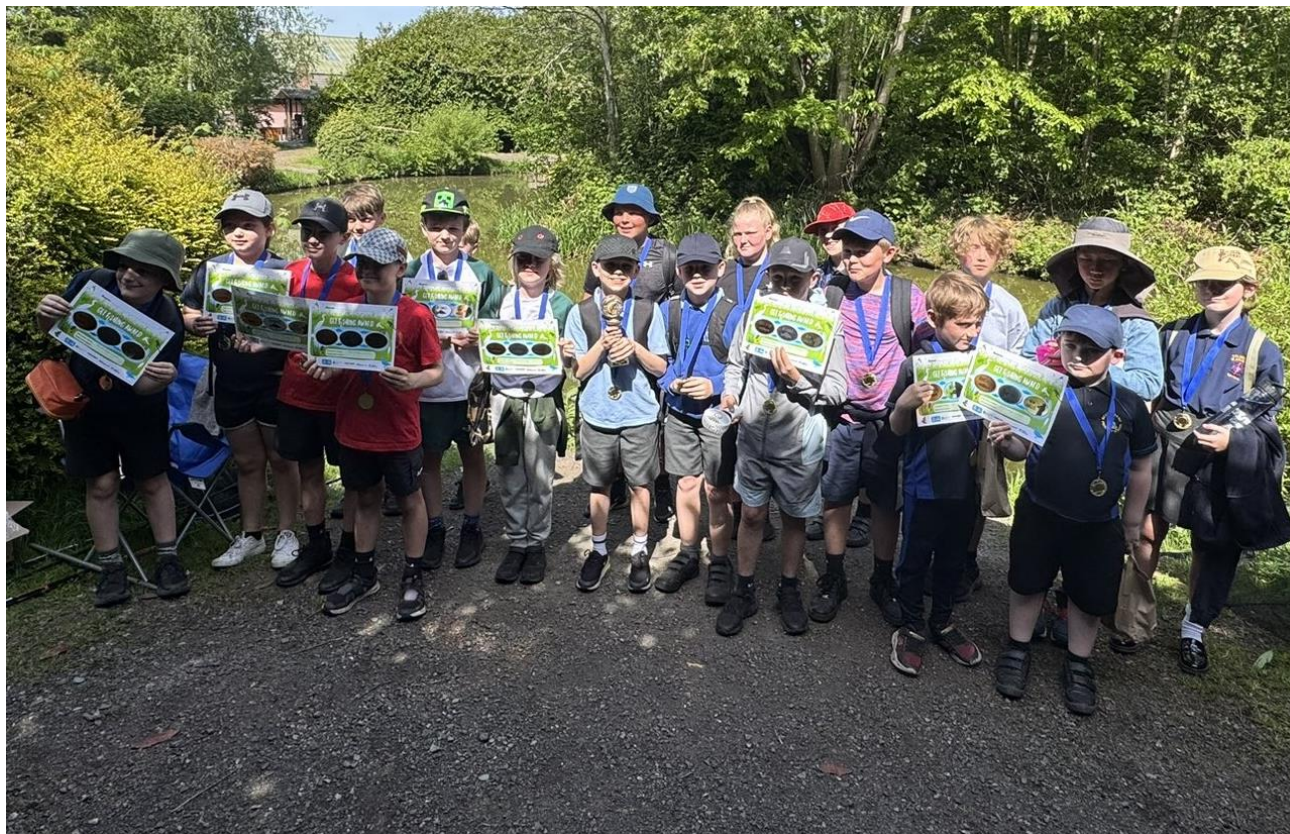
Wednesday 30 th April 2025: Winners of the ATSA Fishing Match: Moorside